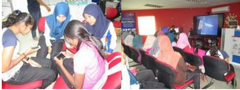
PHOTO EDITING (PHOTOSHOP) (BELIA)